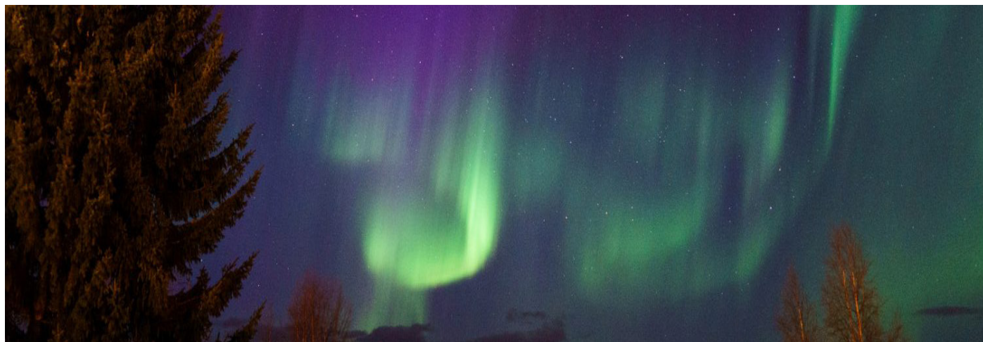
The Aurora Borealis over northern Sweden